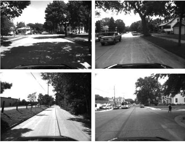
Fig. 1. Some images from the dataset used for the experiment. The entire video sequence can be found at [26].

axes are shown. From these, we observe that the algorithm obtains accuracy ( 3\sigma ) better than 1^\circ for attitude, and better than 0.35m/sec for velocity in this particular experiment.