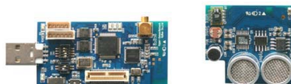
(a) MSP430 mote

The RETOS operating system currently support TI MSP430, ATmega128, Chipcon's CC2430 family of microcontrollers. For DASD implementation, we built MSP430-based nodes, which is similar to Tmote Sky[5], as well as an add-on sensor board. The sensor board has microphone, ultrasound, temperature/humidity, and light sensors. Figure 2 shows the hardware platform used for DASD.